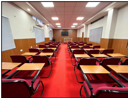
Smart Class Room