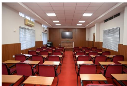
Smart Class Room