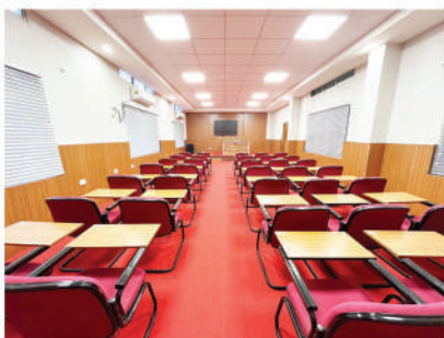
Smart Class Room