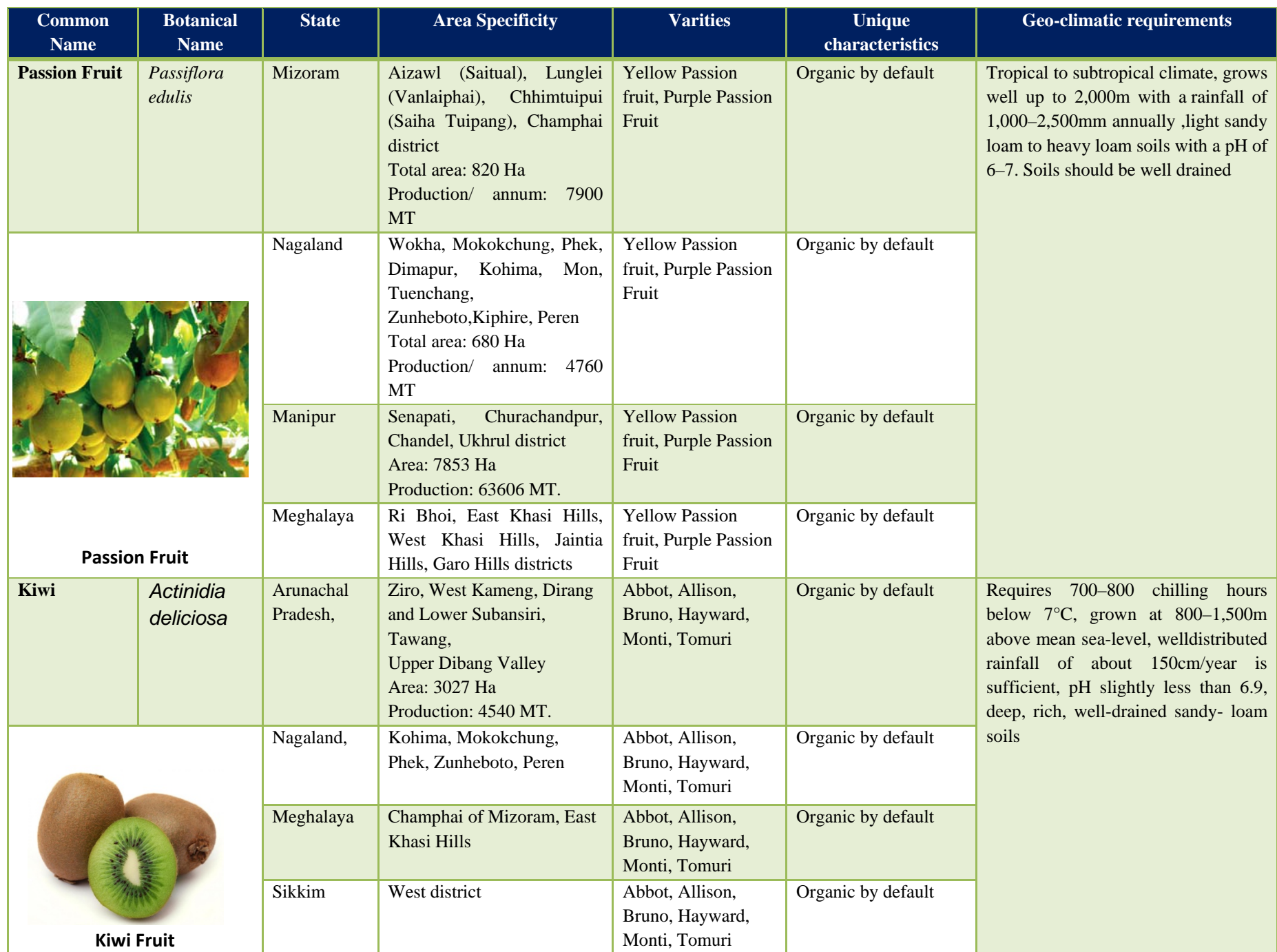
TABLE: SOME HIGH VALUE HORTICULTURAL CROPS GROWN IN NE